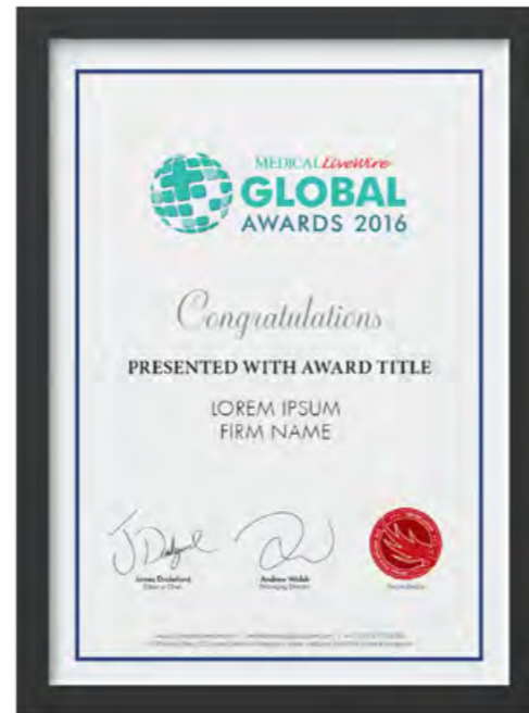
Two Framed award certificates