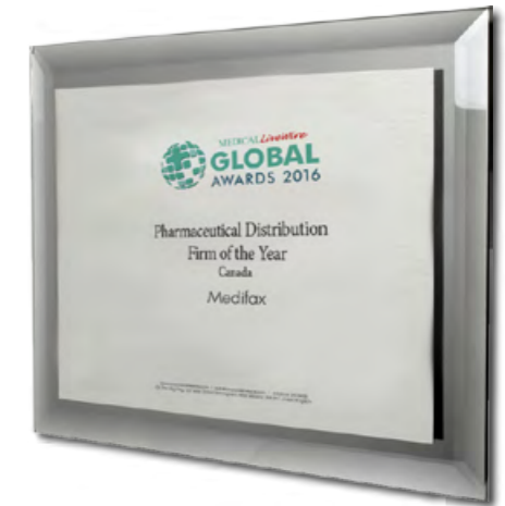
One luxury glass wall plaque