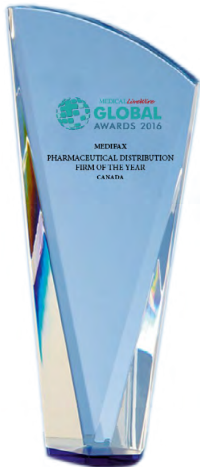
Three engraved crystal trophies (boxed and personalised to reflect your award)