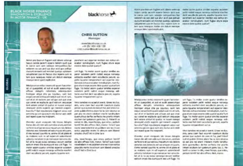
Two pages of priority coverage