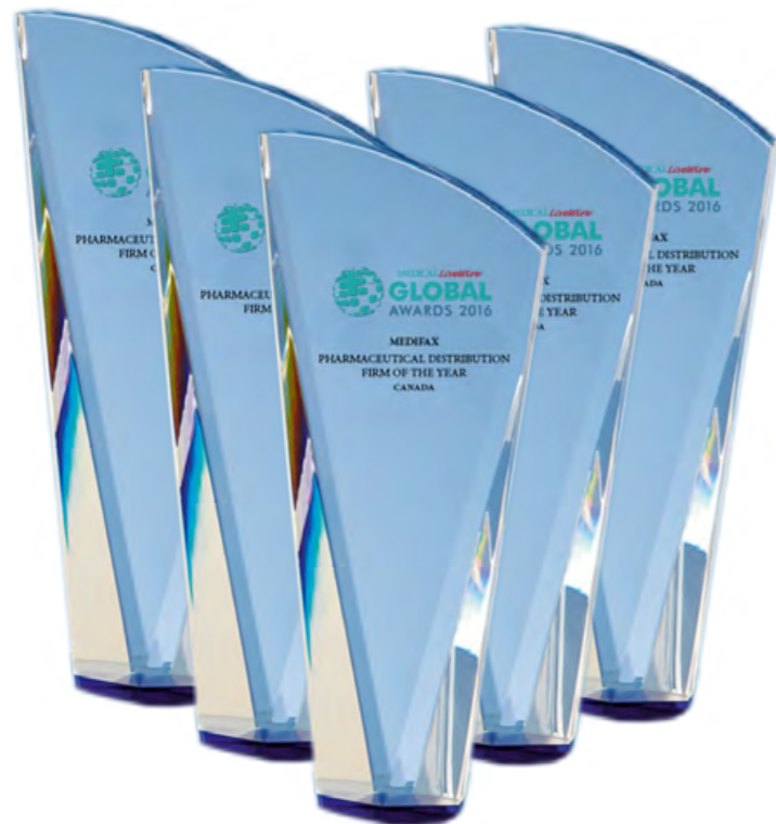
Five engraved crystal trophies (boxed and personalised to reflect your award)