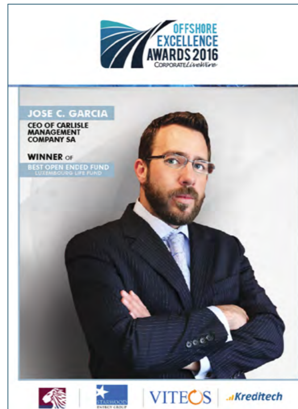
Front Cover Image & headline