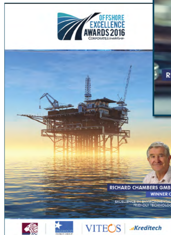
Supporting Image and sub-headline