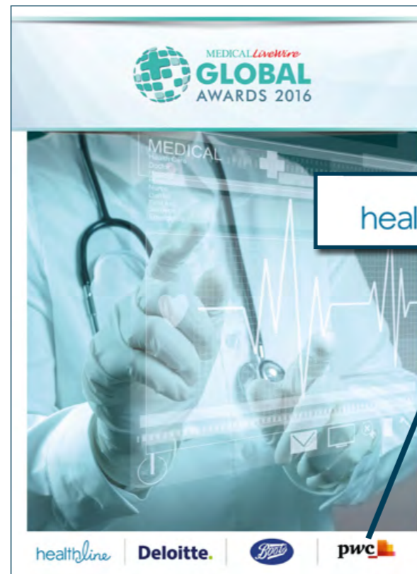
Logo on front cover