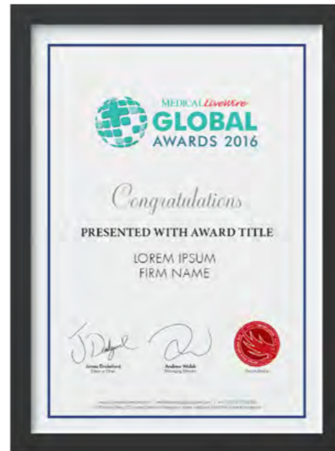
One Framed award certificate