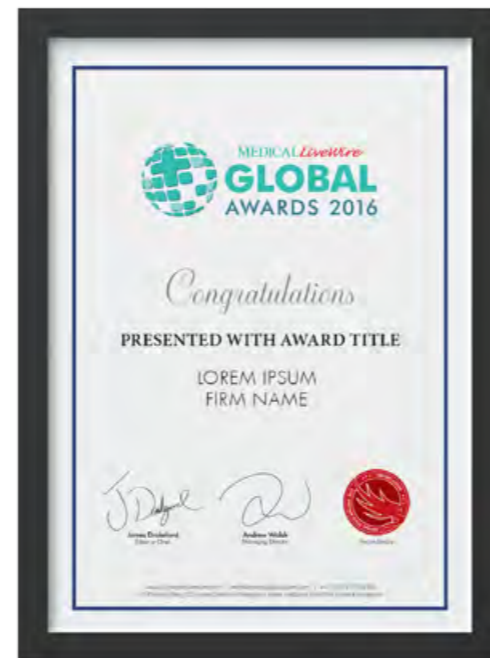
One Framed award certificate