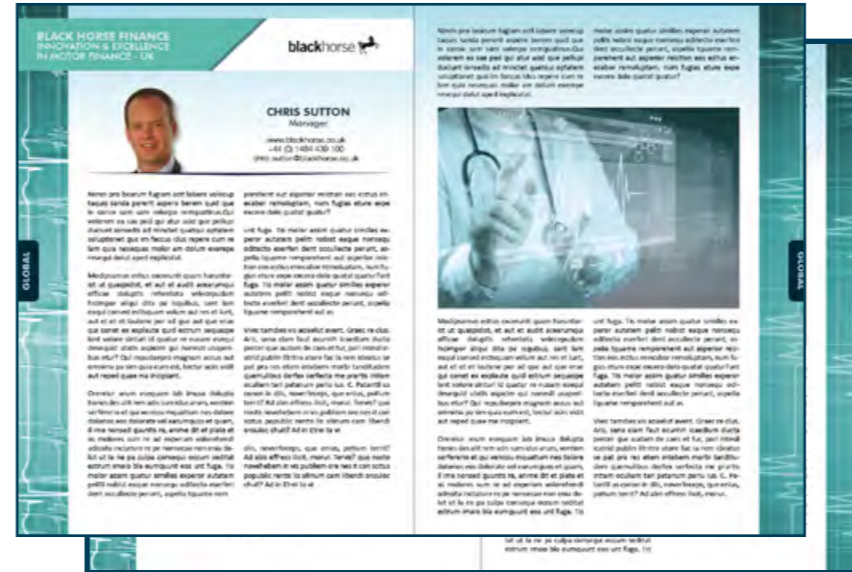
Four pages of priority coverage