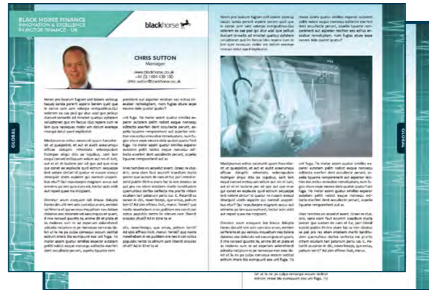
Four pages of priority coverage