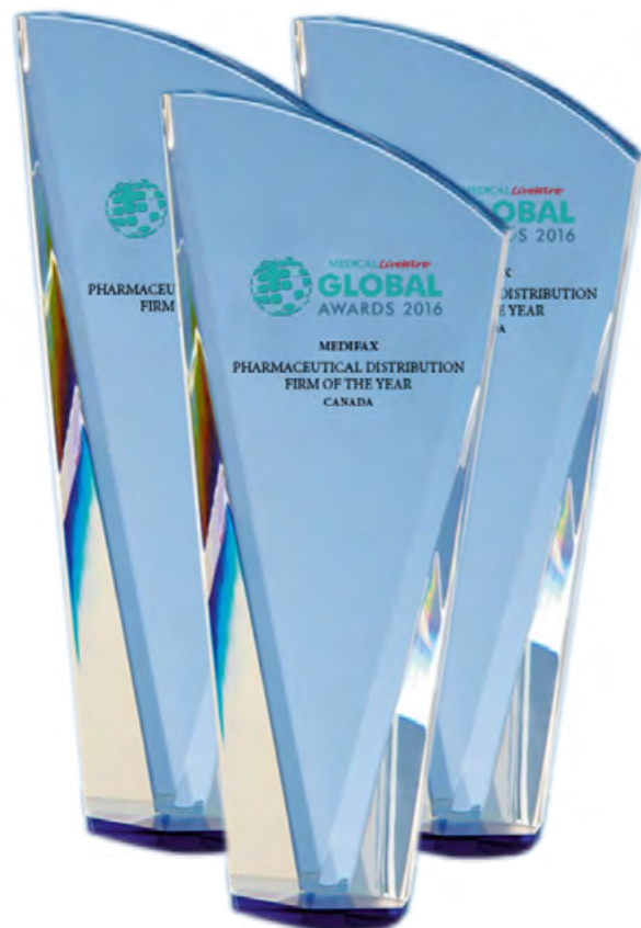
Three engraved crystal trophies (boxed and personalised to reflect your award)