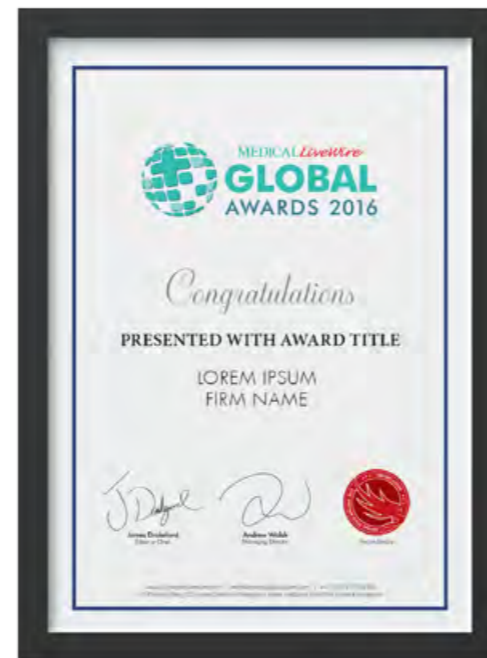
One Framed award certificate